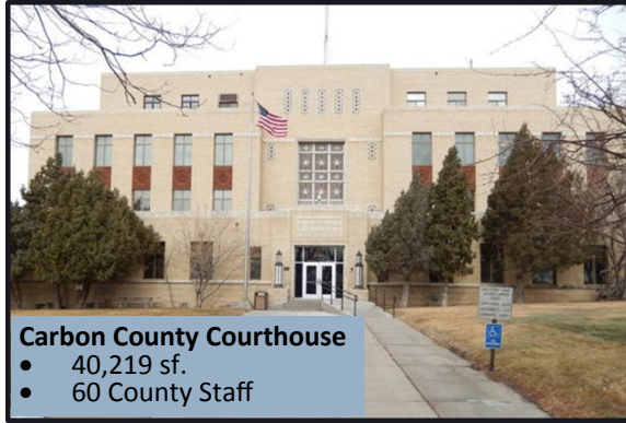
Carbon County Courthouse • 40,219 sf. • 60 County Staff