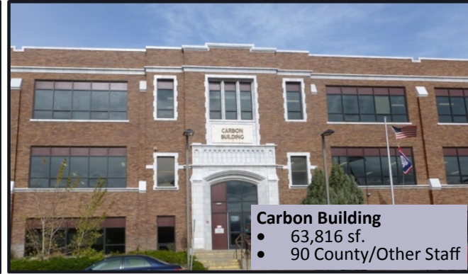
Carbon Building • 63,816 sf. • 90 County/Other Staff